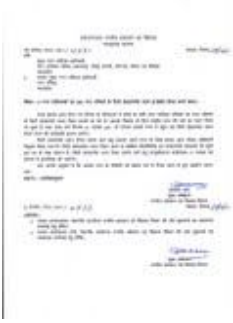
Phase2 of CDPs.jpg 542K